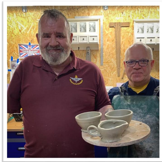
ACVC Veterans Art Hub Glasgow – April 2023

Our policies will continue to be reviewed on an ongoing basis. We have updated the Financial Policy adding in a Reserves Policy and compiled two new policies this year - the Equality and Diversity Policy and Safeguarding Policy. These will be presented at the AGM for approval by members.