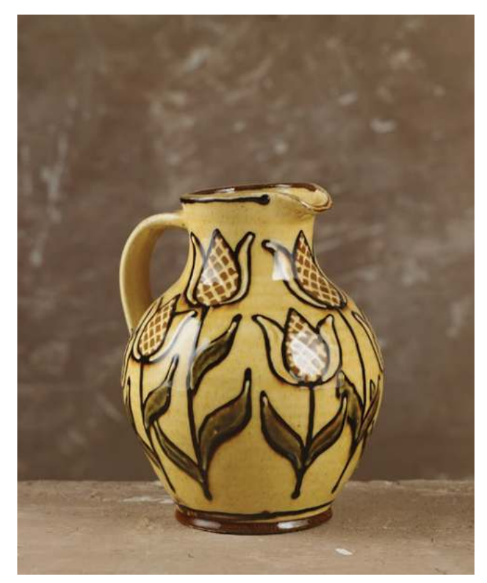
Top: Image courtesy of Hannah. Other images are courtesy of Shannon Tofts showing examples of Hannah's work