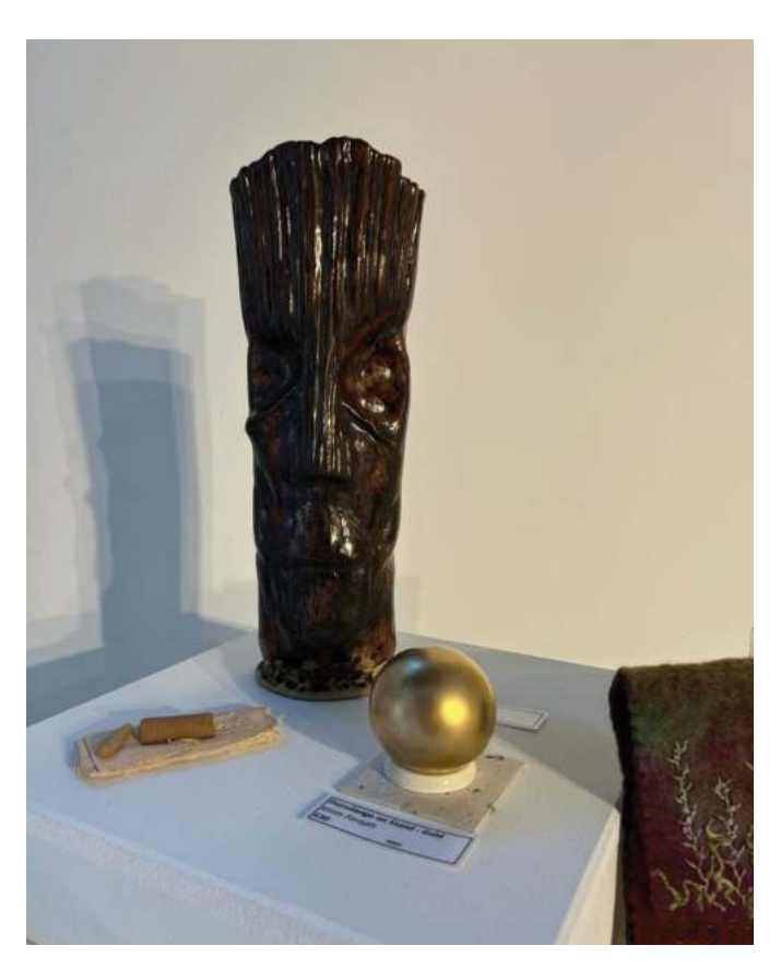
from the Machrie Moor Collaborative's exhibition at The Barony, April 2022