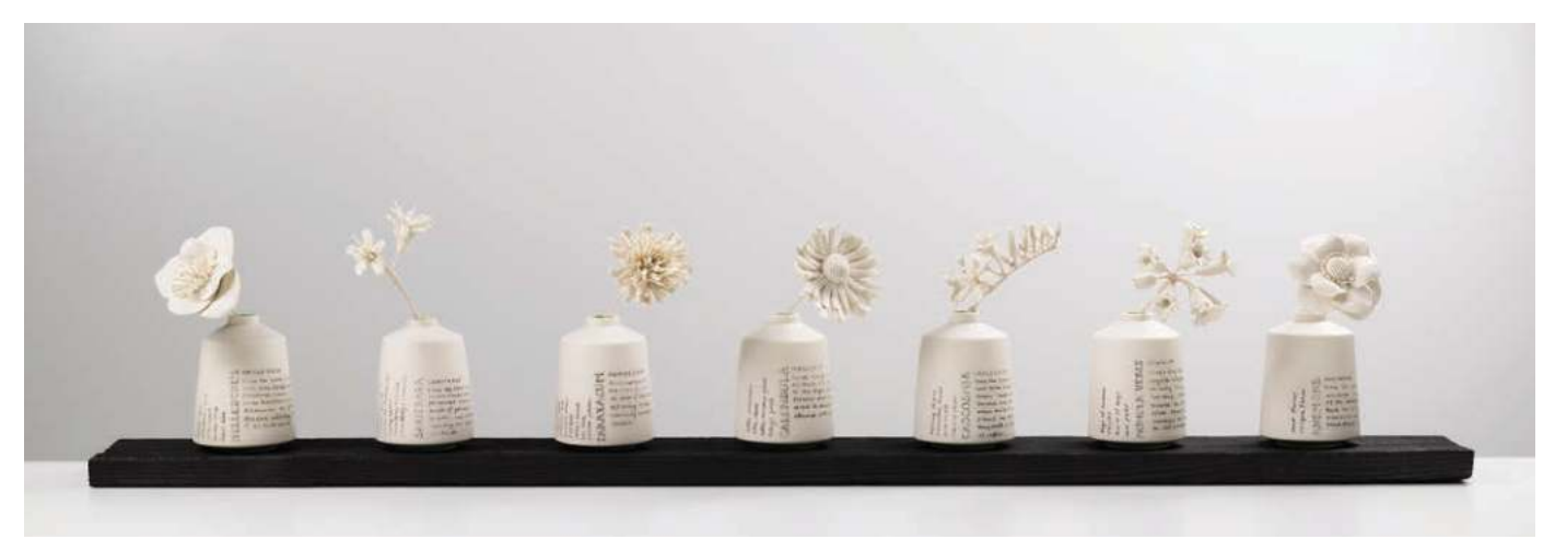
Specimens for Discovery: A series of wheel thrown porcelain bottles with handbuilt porcelain flowers displayed on a charred larch plinth.

Recently I joined the first SPA online coffee morning of the year - I don't always manage to take part but really enjoy them when I do. Amongst other things we were discussing the importance of creative development. It can be easy to forget or avoid this important discipline and I know I find it difficult to allow proper time for it in a busy studio. We talked about residencies, side projects, as well as doing non clay related creative work that might help by running in parallel to your normal practice, and it reminded me of last year's Potfest competition.