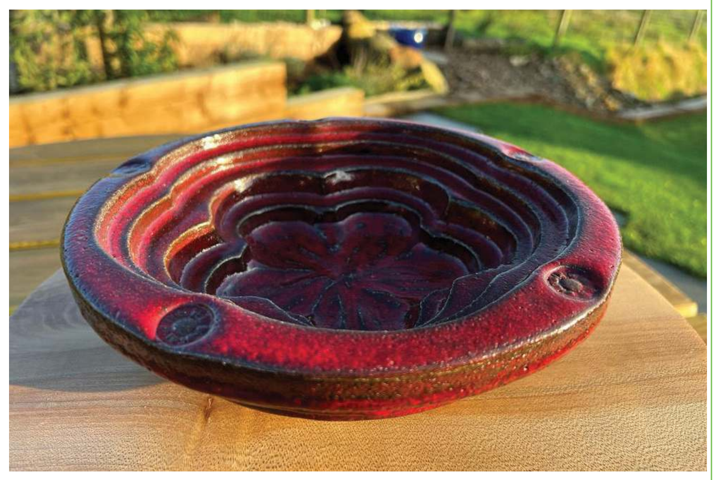
Slab-built bowl inspired by Brodick Castle