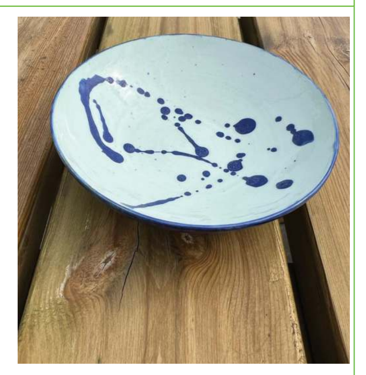
Sea splash bowl

Arran has a vibrant arts community, other potters on the island are generous with their knowledge and skills. A few of us now meet for coffee and are planning joint sessions glaze testing, wood firing and raku firing. Who knows where these new Arran pottery friendships will lead? I am sure that with other potters the fun is guaranteed.