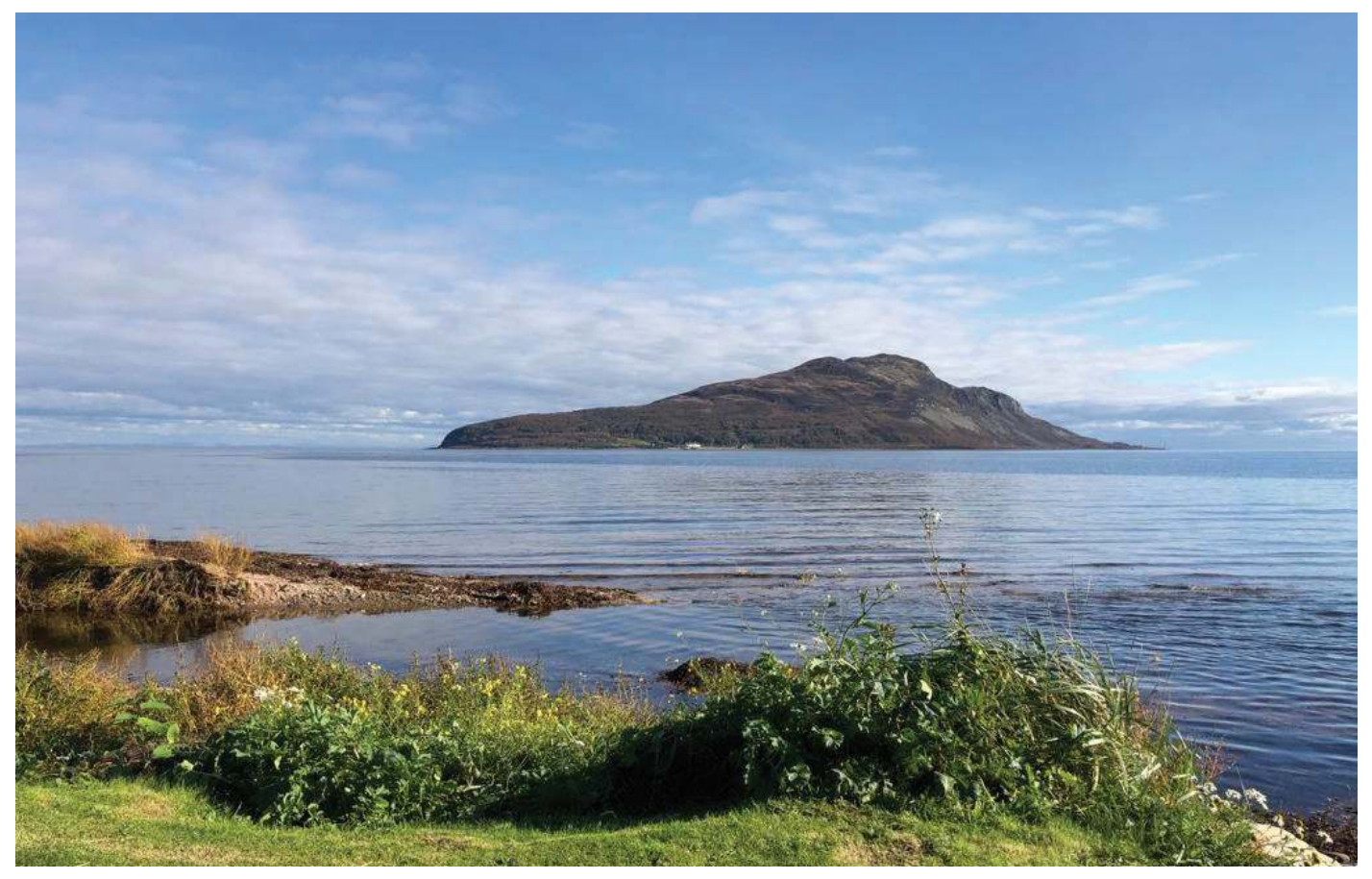
Lamlash Bay and the Holy Isle

The neighbouring farmer has given me permission to dig the natural red clay that can be found in ditches on the farm. It is astonishing to think that this clay is the same clay that was used by Neolithic people on Arran 10,000 years ago, and that we can see in